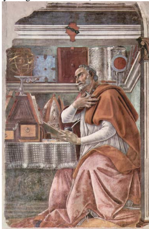
St. Augustine by Botticelli.

It's a little puzzling to put this together with Botticelli's picture, showing Augustine looking prayerful but with scientific instruments in plain sight! (Augustine was very interested in science and many other unholy things earlier in life.)